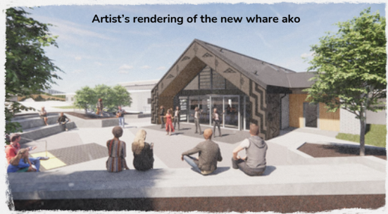
Artist's rendering of the new whare ako