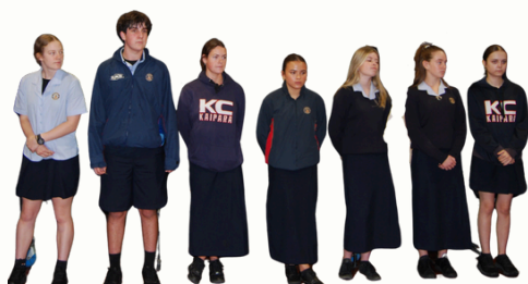
Photo of some of our recent recipients of NCEA excellence Endorsements. See more on the previous page regarding this celebration.